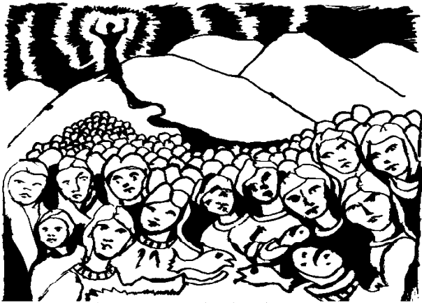
Jesus took the loaves, gave thanks, and distributed them