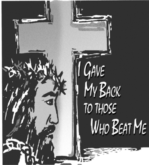
Palm Sunday of the Lord's Passion